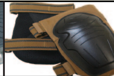
X-Treme Duty Knee Pads