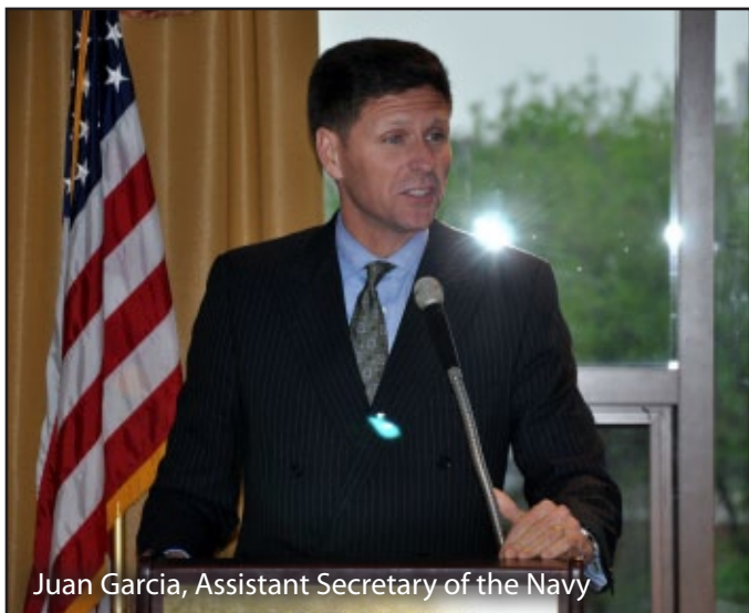
Juan Garcia, Assistant Secretary of the Navy

ment to YN1 in 2009, he was selected as NR COMSUB-GRU9 FP2's Leading Petty Officer, where he is responsible for the morale and welfare of 48 selected reserve Sailors. He volunteers his time as a "boot camp for Kids" instructor at the Mariner Square Athletic Club, and has organized a unit volunteer program with the USS Hornet (CV-12). He is the Secretary of the Navy Operational Support Center Alameda First Class President Association. He works at Thermo Fisher Scientific as a Regional Supervisor, managing