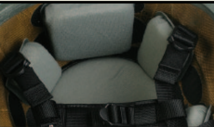
Ballistic Helmet Pads

SKYDEX is the industry leader in developing innovative impact mitigation, blast-limiting and vibration attenuation solutions for today's most demanding military and commercial applications. SKYDEX utilizes its patented twin-hemisphere thermoplastic polyurethane (TPU) technology to design and manufacture a wide range of products that absorb the energy from blasts and reduce operation vibrations to increase survivability and stamina for our client's most important assets – the human operator.