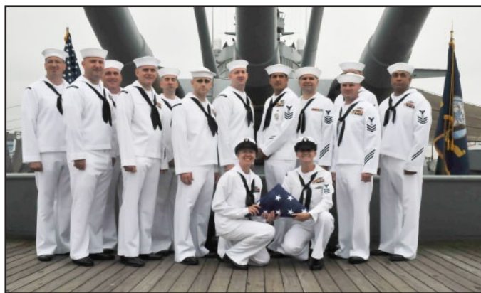
Ft. Dix, Earl New Jersey Selectees