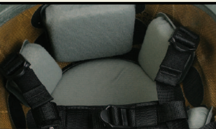
Ballistic Helmet Pads

SKYDEX is the industry leader in developing innovative impact mitigation, blast-limiting and vibration attenuation solutions for today's most demanding military and commercial applications. SKYDEX utilizes its patented twin-hemisphere thermoplastic polyurethane (TPU) technology to design and manufacture a wide range of products that absorb the energy from blasts and reduce operation vibrations to increase survivability and stamina for our client's most important assets – the human operator.