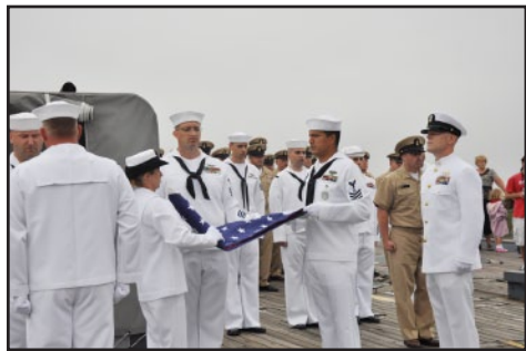
Flag Ceremony on USS New Jersey