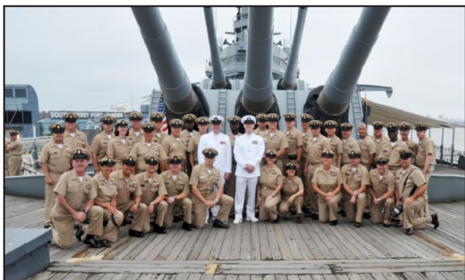
NAS FDML and Earl NJ Chiefs