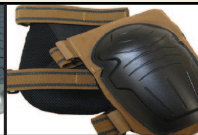
X-Treme Duty Knee Pads